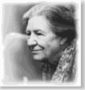
Isabel Briggs Myers 1897-1980